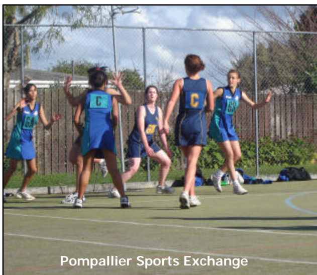
Pompallier Sports Exchange

Three days before the NZASA tournament our school was visited by Pompallier Catholic College for a Sports Exchange. After a number of changes and last minute alterations, our Secondary School students competed in Boys 12 aside rugby, Girls 7's, Netball and Basketball. Congratulations to our Team one Netball and both boys and girls basketball for their wins.