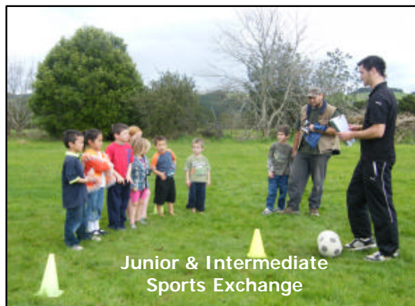
Junior & Intermediate Sports Exchange

Our primary and intermediate syndicates kicked term 3 off with a sports exchange with Poroti, Pakotai and Te Horo. Students completing the Sport and Recreation Course at North Tec ran the day of sport and fun as our students moved around experiencing a variety of activities designed to develop team work and fundamental skills.