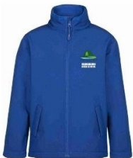
MAS JUNIOR BLUE JACKETS

Thank you to those who completed the online survey regarding jerseys. It was pretty unanimous for both parents and students for polar fleece. I am awaiting samples from the uniform company. However, these will not be available for purchase until early next year. Please remember your child may wear a plain sweat-shirt (not hoodie) under their school jacket.