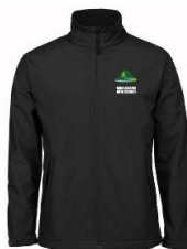
MAS SENIOR BLACK JACKETS