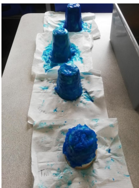
Finished making Leaving to dry.