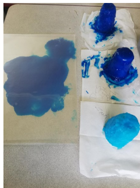
Showing signs of cracking and separation.